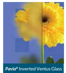
Pavia ® Inverted Ventus Glass